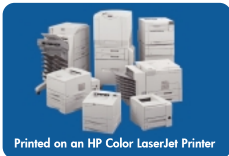
Printed on an HP Color LaserJet Printer