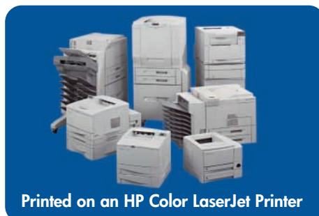
Printed on an HP Color LaserJet Printer